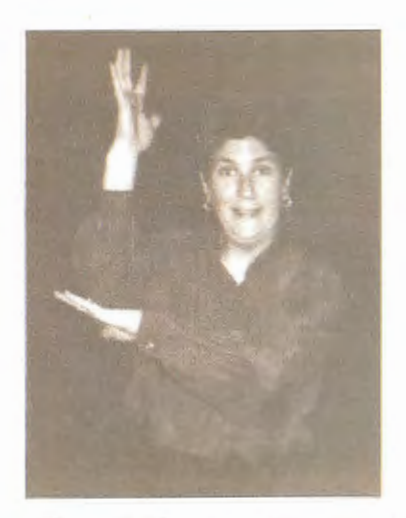
Figure 7: The sign of "tree" in ASL (Taub 2001:20)

Another major device for shape representation is to trace the shape of the referent in signing space. For example, in TSL, "paper" is represented by tracing a square space with index fingers of both hands (Fig. 8). Similarly, TSL "moon" is represented by tracing the shape of a crescent moon with the thumb and index finger of the dominant hand (Fig. 9). In this device, the hand movement doesn't depict the movement of the referent over time but only traces the shape of the referent in signing space. This device was referred to as 'virtual depiction' by Mandel (1977) and as 'path-for-shape iconicity' by Taub (2001).