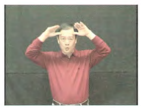
Figure 14: The sign of "dog"

This device uses the characteristic part of the referent to represent the referent. This method is very productive in TSL as well as in ASL. For example, DOG in TSL is represented by the two hands flapping both sides of the head (Fig. 14). The representation is a depiction of the head of a dog with two ears flapping back and forth. For another example, HOUSE in TSL is represented by the two hands touching to form a shape of the sliding roofs of a house (Fig. 15). This kind of device is also employed in TSL to represent actions. For instance, WALKING can be represented by moving index finger and middle finger alternatively (Fig. 16). The two fingers represent two legs of a human body. The part-for-whole representation is also pervasive in spoken languages. Nonetheless, the visual representations of the characteristic parts in sign languages are more direct and iconic.