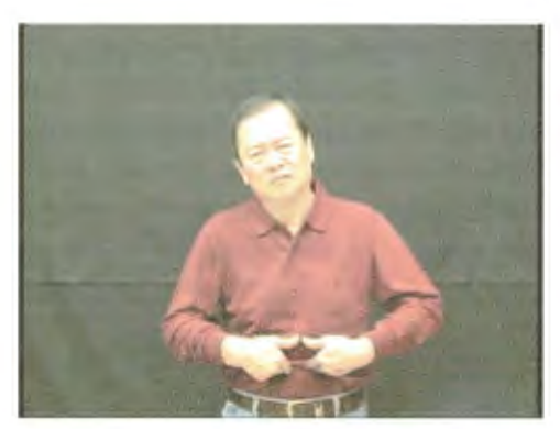
Figure 19: The sign of "hungry"

Modality Effects: Iconicity in Taiwan Sign Language