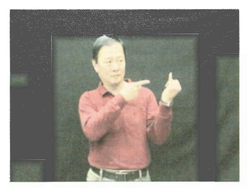
Figure 2: The sign of "she"