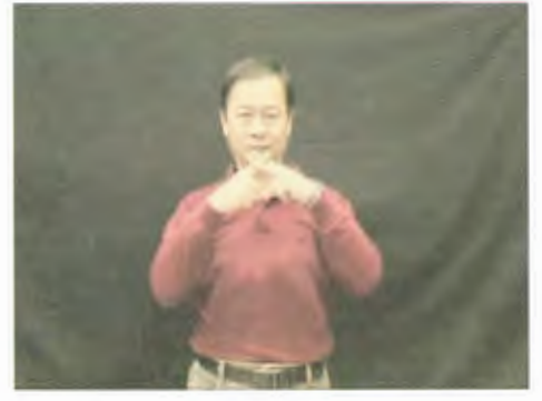
Figure 11: The sign of "small"